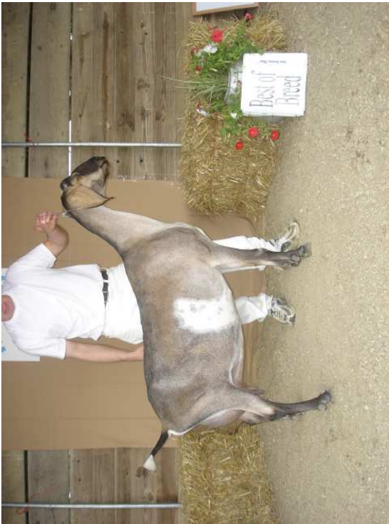
2009 Best of Breed Specialty Winners